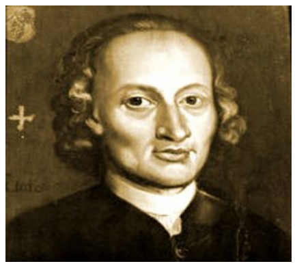
September 1, 1653 -March 9, 1706

excerpt from https://www.classicfm.com/ composers/pachelbel/music/pachelbels-canon-dfacts