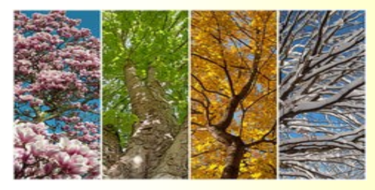
Excerpt and photo from 'Story Behind The Four Seasons by Vivaldi' at Galaxy Music Notes.com

range of metaphors. Vivaldi's 'The Four Seasons,' sits at the very pinnacle of classical music alongside Beethoven's 'Fifth Symphony.'