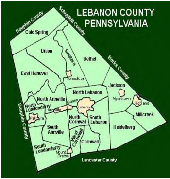
Lebanon County map courtesy of Ed McClelland on usgwarchives.net